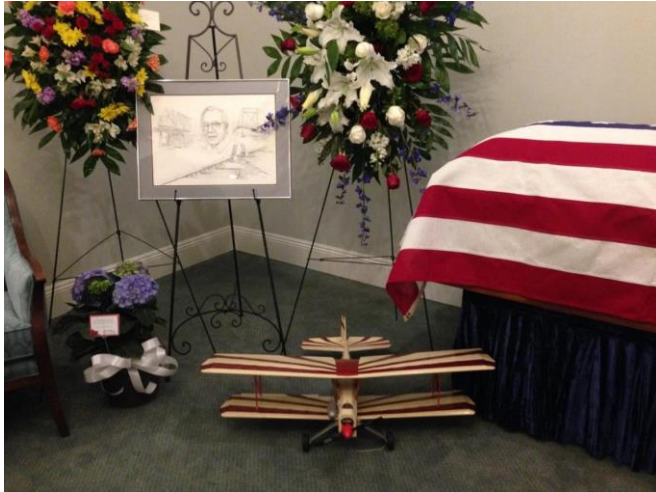
Rest well, friend