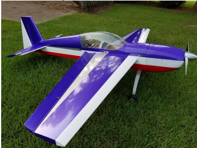
Extra 300 42% Aerotech for sale

Please post my airplane for sale in the newsletter; it is a super deal for someone wanting a 42% airplane.