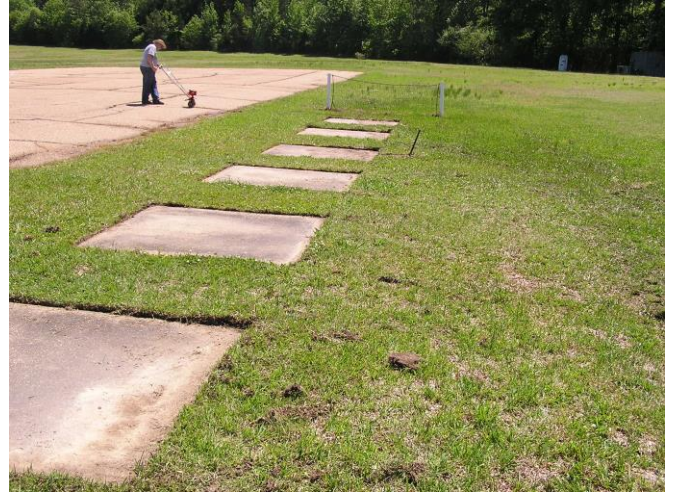
Look at those nicely manacured flight pads

Eight workers gave time and sweat to make Hinkle field ready for our biggest fly in.