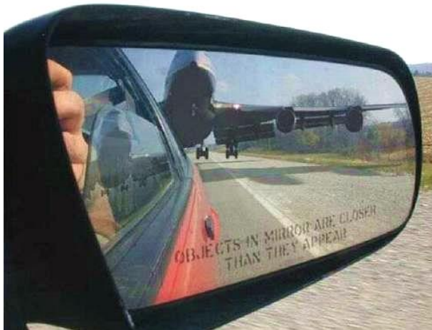
Be alert while driving to the meetings.

Springridge Road (Exit 36) south 1½ miles to North McRaven Road, and then go east ¼ mile to park entrance. A current AMA license is required to fly at Hinkle Field. Also please be aware that some channels have experienced interference. Do not use channels 16, 17, 21, or 44 at Hinkle Field. No known problems have been reported with spread spectrum (2.4GHz).