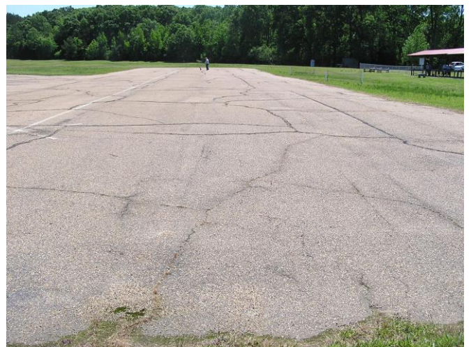
Gone is not only the grass, but my excuse for ground looping, Wayne